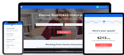
End-to-end Micro-BOP Solution login, coverage, and quote screens.

Guidewire was recently positioned as a Leader in the 2021 Gartner® Magic Quadrant™ for P&C Core Platforms, North America 1 for InsuranceSuite, marking its seventh consecutive year in the report. Guidewire was also named a Challenger for the fifth consecutive time in the same report for InsuranceNow. In addition, Guidewire has been positioned as a Leader in the 2021 Gartner Magic Quadrant for Non-Life Insurance Platforms, Europe. 2 This is the fourth consecutive year InsuranceSuite has been recognized in the report.